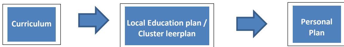
Figure 1: How to build your personal plan using the Curriculum and Local Education Plan or Cluster Education Plan.

The curriculum describes competences, skills and knowledge, which are to be achieved partially by completing courses or theoretical studies, but mainly by working in the routine clinic, participating in clinical, innovation, and research projects, and by (patient) counselling. Appropriate projects are not continually available, as availability depends on developments in institutes or hospitals. Therefore, each resident has to design an individual plan in which she or he arranges participation in upcoming projects at the different hospitals taking part in the education of the resident in such a way that she or he has been educated and experienced in all topics of the relevant curriculum at the end of the four-year residency. Of course, the initial personal plan of education can be adjusted to new or unexpected projects during the residency, as long as the minimum requirements spent on each topic are still met.